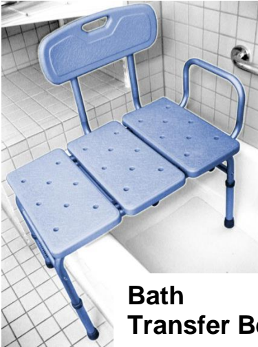
Bath Transfer Bench