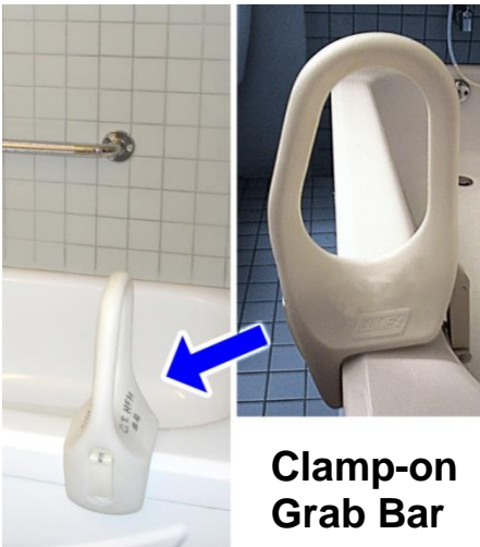
Clamp-on Grab Bar