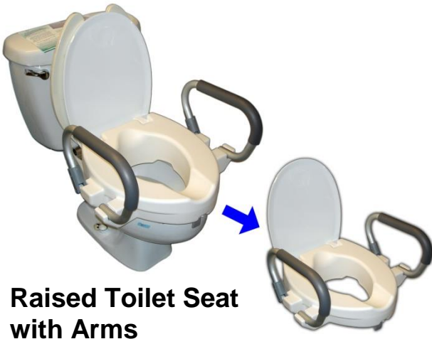
Raised Toilet Seat with Arms