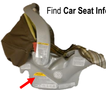
Find Car Seat Information...