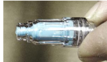
Central Line Cap