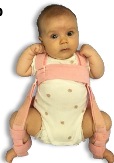
Baby wearing a Pavlik Harness

It is simple to treat the condition as soon as it is confirmed. We usually use a Pavlik Harness. It is made from soft cloth. When worn as directed, it positions the hip joints in such a way that condition corrects itself as the baby grows - often within a couple of months. In most cases, there is no need for surgery.