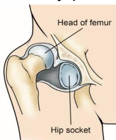
Dislocated hip joint

The hip joint is like a ball (head of femur) in a deep socket. Normally, the ball fits firmly in the socket.